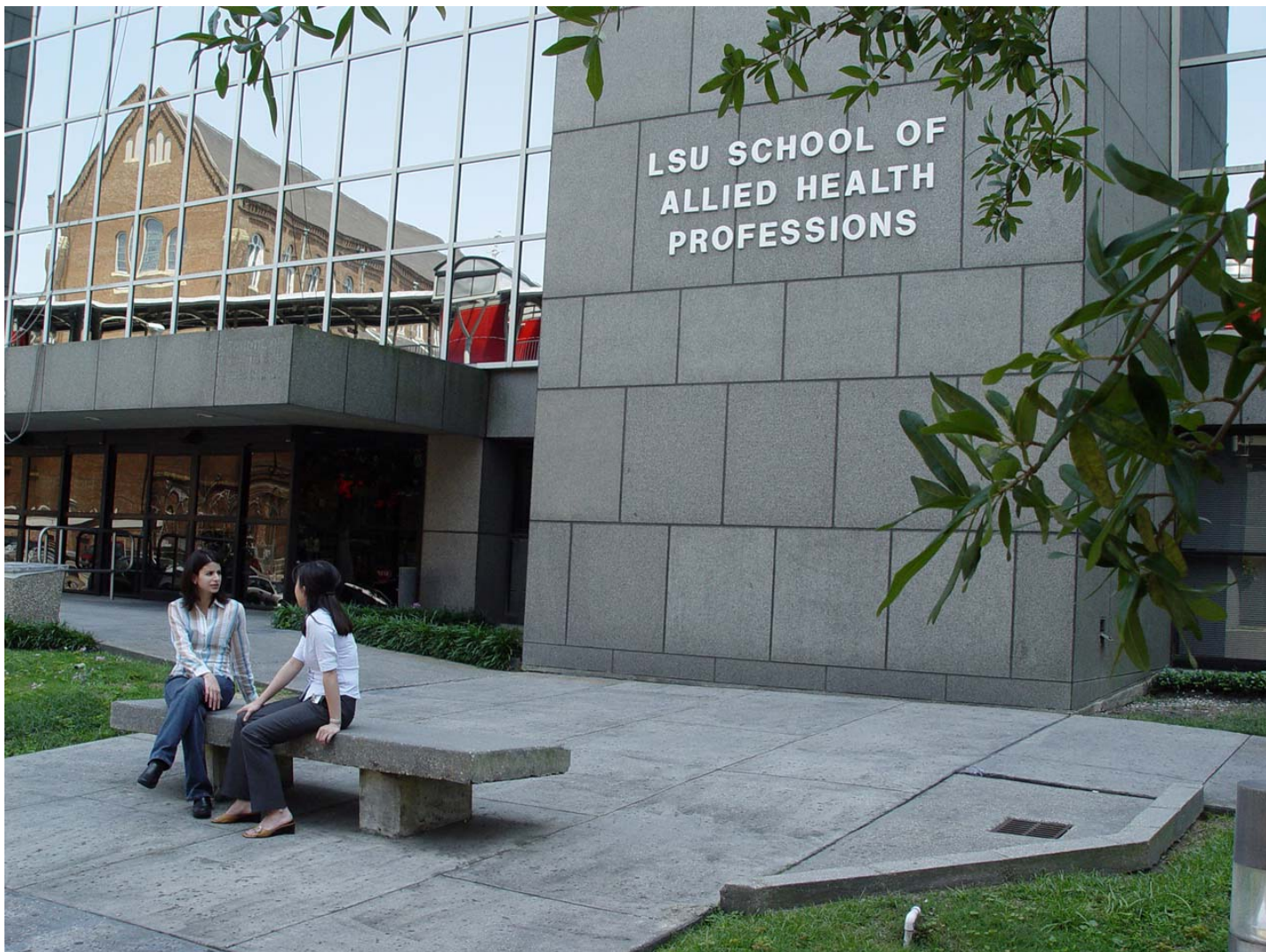
LSU Health Sciences Center in New Orleans School of Allied Health Professions