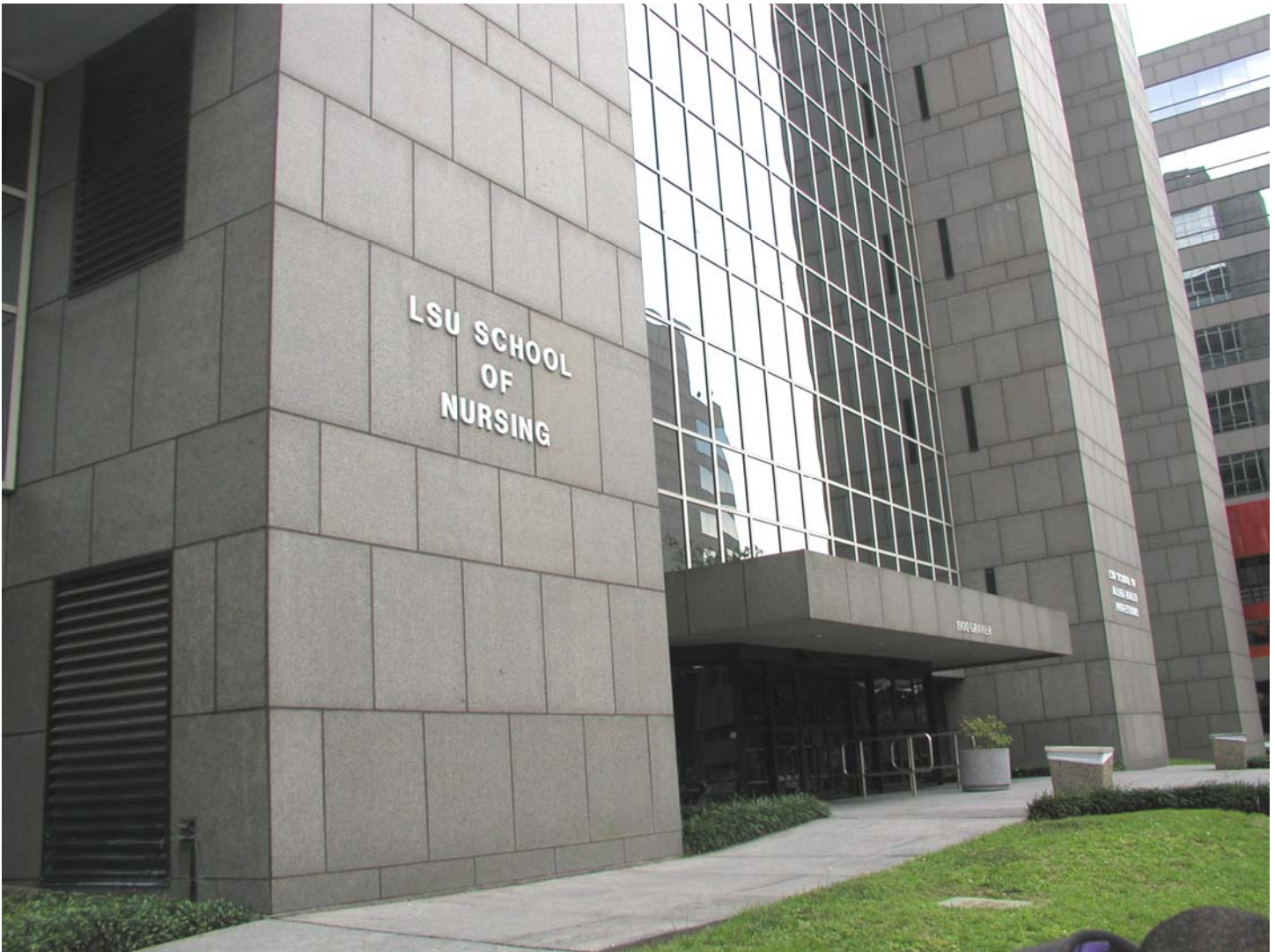
LSU Health Sciences Center in New Orleans School of Nursing