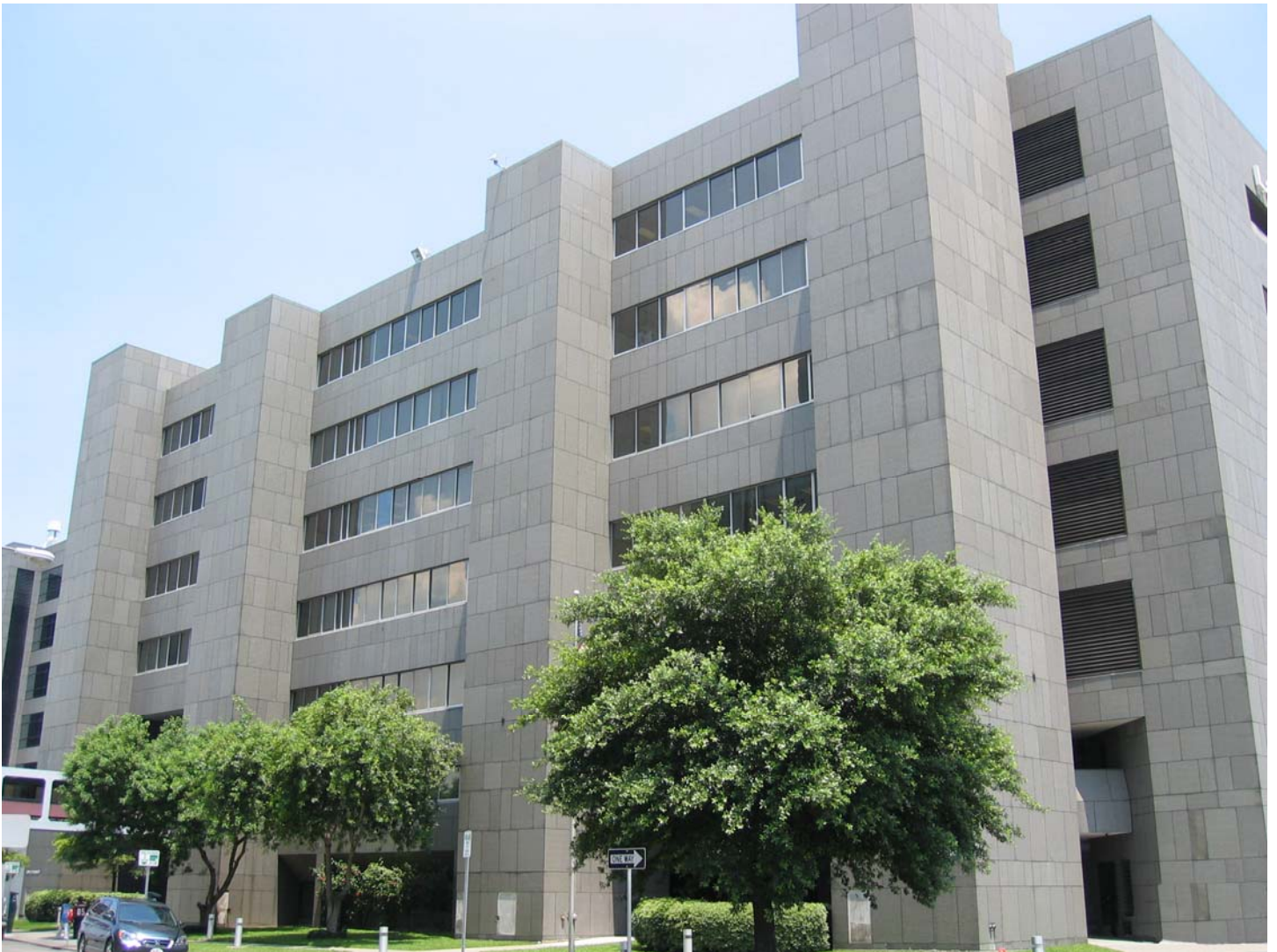
LSU Health Sciences Center in New Orleans School of Graduate Studies