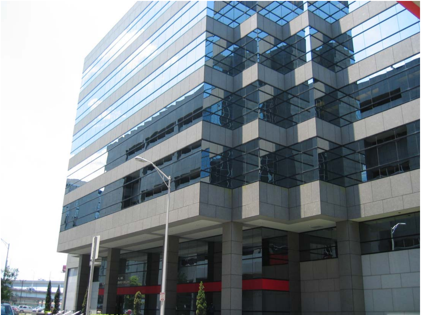
LSU Health Sciences Center in New Orleans School of Medicine