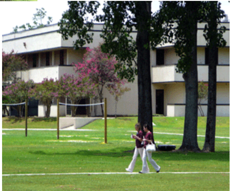
LSU Health Sciences Center in New Orleans School of Dentistry