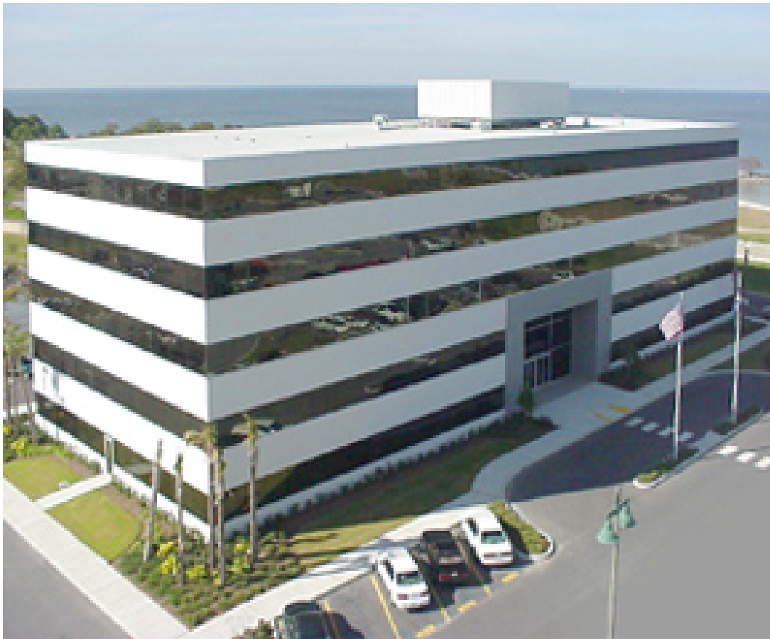
LSU Health Sciences Center in New Orleans School of Public Health